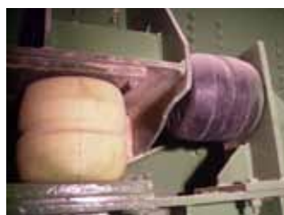
Longitudinal stops or traction springs To limit forward or backward movement of the machine under load