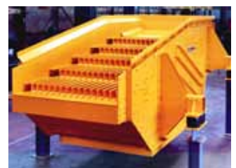
Skirt plates To restrain material overflow