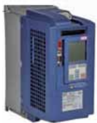
Frequency converter To control flow rate of feed