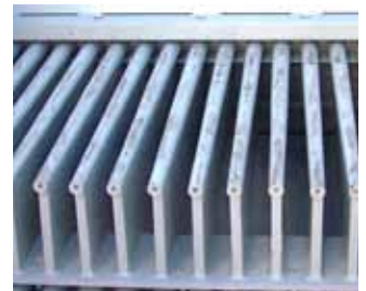
Conical grizzly bars For heavier applications with sticky material