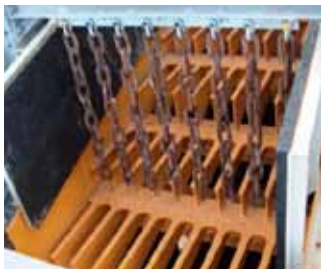
Static inlet hopper With chain curtain or steel plate curtain