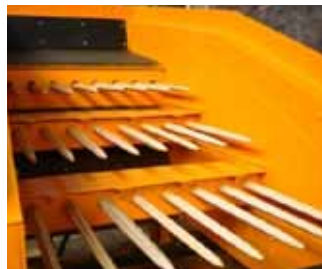
Heavy duty forged rods For pre-screening sticky material