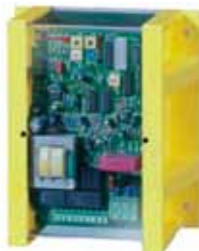
Electronic brake To quickly stop the grizzly feeder