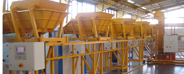
Traversable Design facilitates economic distribution of products to e.g. several in-line storage feeders.