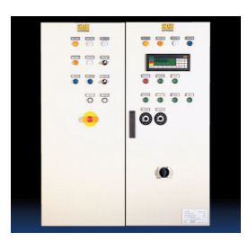
Control Panel for either simple manual operation, or alternatively auto-matically operated by associated equipment, e.g. from furnace loading unit.