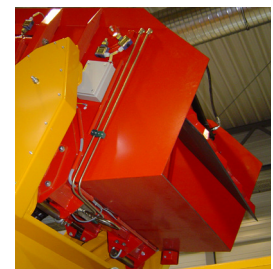
Tipping in Steps allows partial filling of e.g. the storage feeder for optimized disentangling of very difficult products.