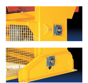
Direct Access to Chain Adjuster. Combined with the easy chain wheel repositioning, the chain adjuster indicates the exact time for chain replacement.

Tips 180° and includes a "final action" repeat tipping to ensure optimal product discharge.