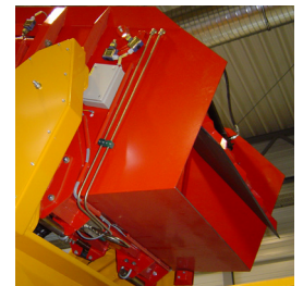
Tipping in Steps allows partial filling of e.g. the storage feeder for optimized disentangling of very difficult products.