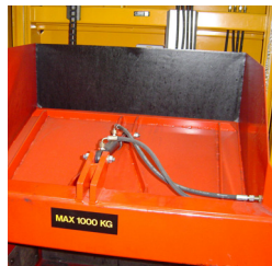
Pneumatic/Hydraulic Operated Cover ensures the most gentle transfer of products from container to the subsequent machine e.g. storage feeder.