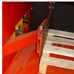
Pneumatic/Hydraulic (depending on lift-tipper size) Clamping Arrangement, facilitates easy locking of varying container sizes.