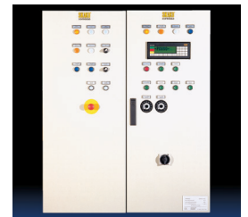
Control Panel for either simple manual operation, or alternatively auto-matically operated by associated equipment, e.g. from furnace loading unit.