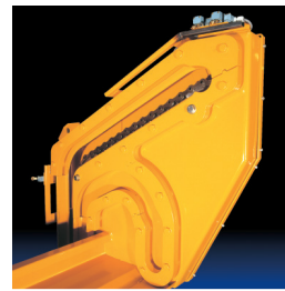
Heavy Duty designed "Jamming Free Guideway" for the "hoist chair" wheels included as standard.