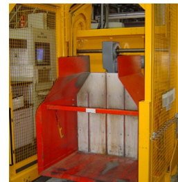
Light Barriers (standard) gives a smooth and easy access to the "hoist chair".