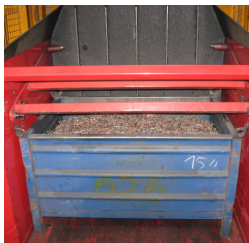
Locking Bar Arrangement manually adjustable for various container heights.