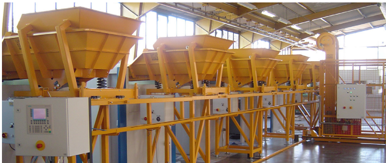
Traversable Design facilitates economic distribution of products to e.g. several in-line storage feeders.