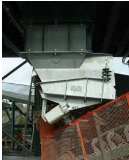
Open Feeder 800X1000MM