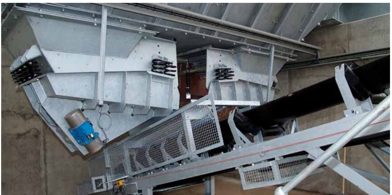
Open Feeder 1000X1250MM