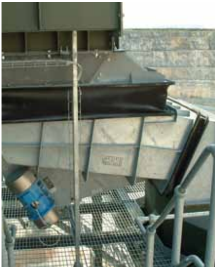
Dust Proof Feeder 1250X1600MM