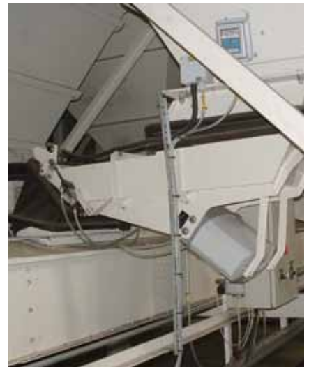
Dust Proof Feeder 400X1000MM